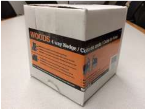
Product in package

Woods® announces the recall of a 4-Way Wedge accessory for the hydraulic log splitter.